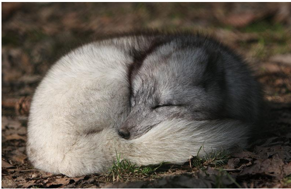
Figure 1 image from: https://en.wikipedia.org/wiki/File:Alopex_lagopus_IMG_9019.JPG

capas lined with fur, long tunics, and high boots. The women wore long shirts with a lace-up bodice over it. They wore long skirts almost to the floor or floor length. Sometimes they would wear an over-skirt or an apron over the skirt. They would braid their hair in elaborate braids and had beautiful scrollwork on their skirts and dresses.